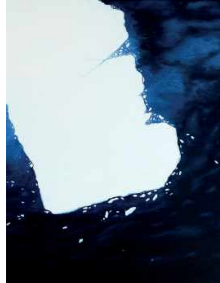
D28 2021 (detail) / oil on canvas / 140 x 140 cm / 2022 / Kevin Eason

Glacial Fire – a Pamphlet of Love Poems , cover front: Cuverville Island, Antarctica back: Qeqertarsuaq, Greenland