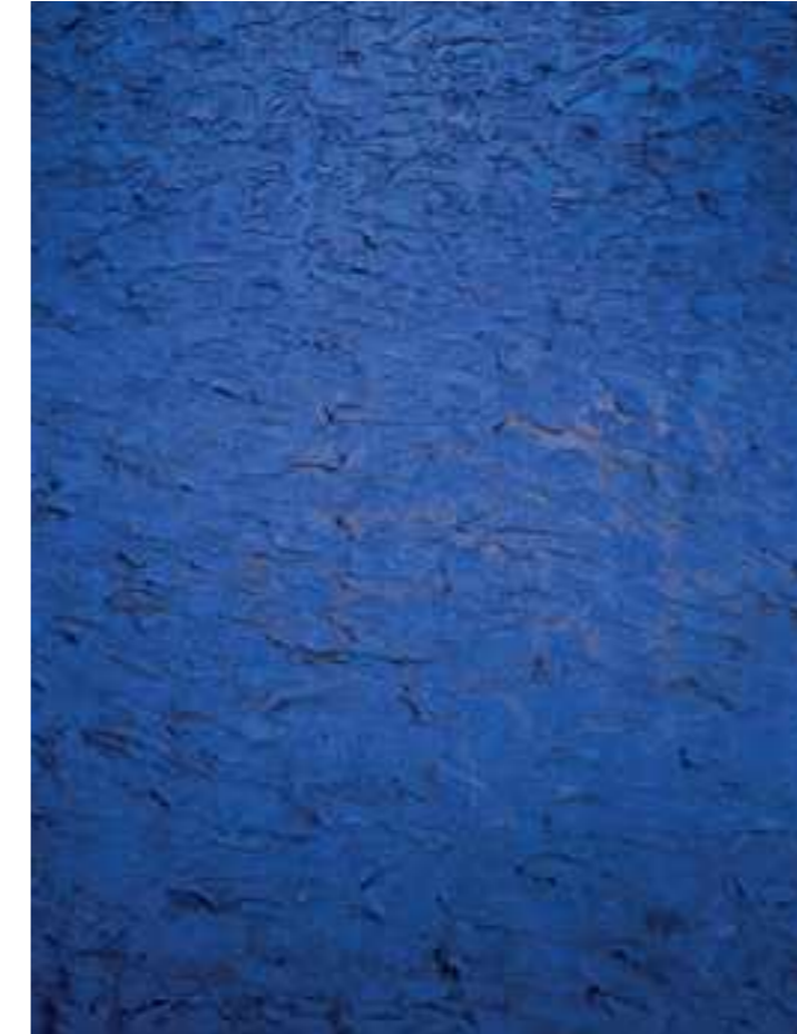
7 Glacier XXVI (Before sunrise 05.05 AM) / oil, pigment and marble grit on canvas / 230 x 200 cm / 2023 / Robert van Keppel