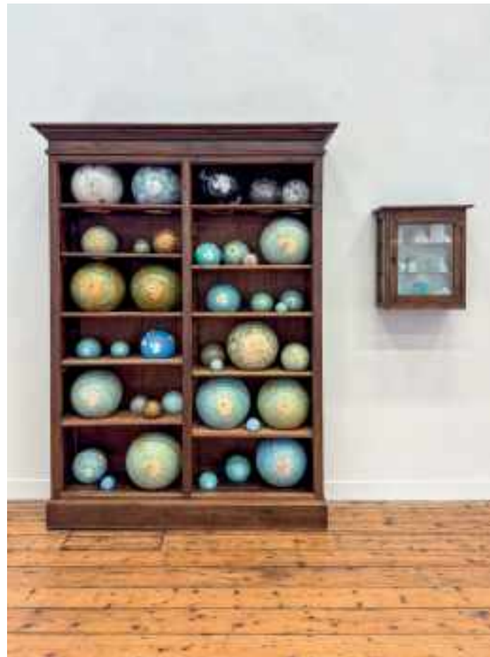
Facing Antarctica + Archive of Icebergs #3 / mixed media / 230 x 170 x 40 cm + 62 x 53 x 26 cm / 2025 / Esther Kokmeijer