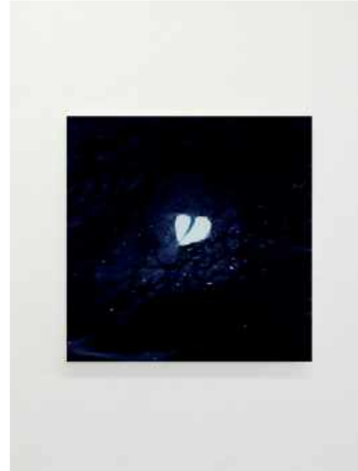
D28 2023 / oil on canvas / 140 x 140 cm / 2023 / Kevin Eason