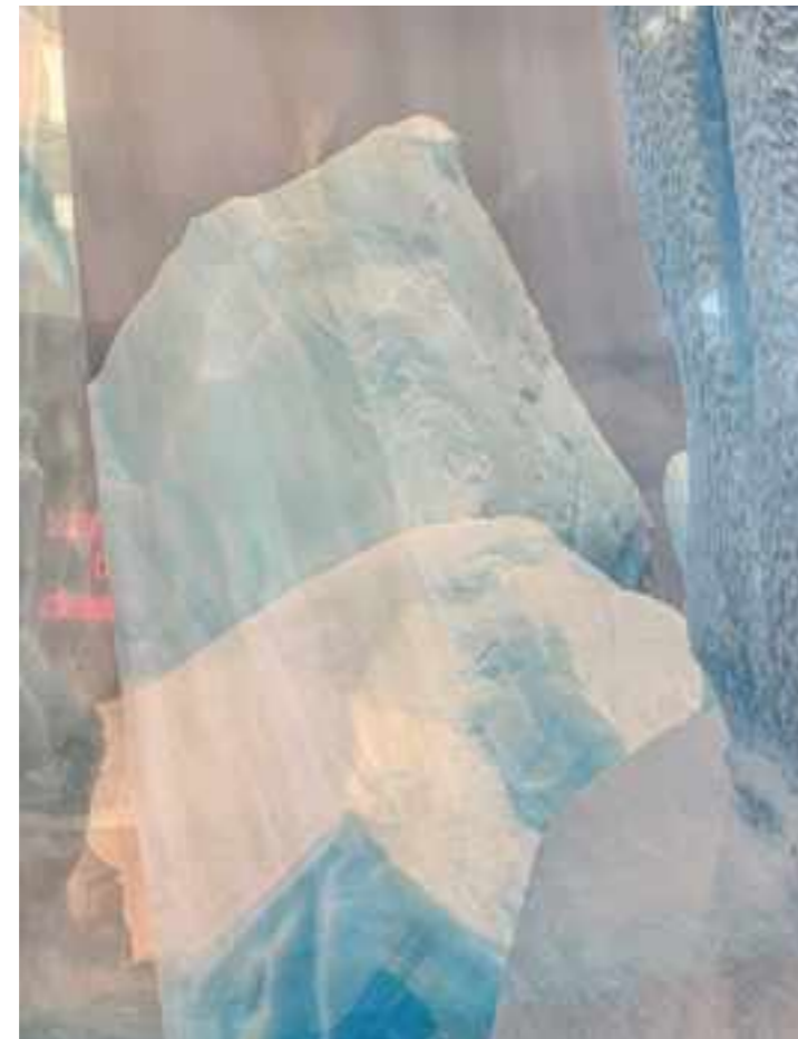
Iceberg Alley #2 / textile / 770 x 300 x 200 cm / 2025 / Esther Kokmeijer