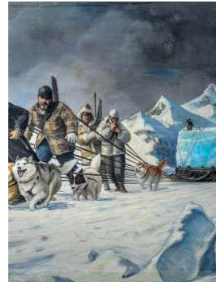
The Last Ice Project (detail) / 122 x 224 cm / oil on canvas / 2024 / Brian Goggin and Geoff Rockwell